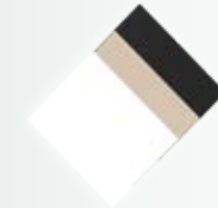
Hemp Folding Board

See the attached Product Comparison Chart for more information.