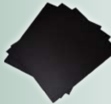
Gane Premium Black Board