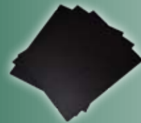
Solid Black Chipboard