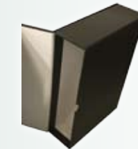
Gane EuroWhite™ White One-side Graphic Board