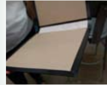
High-Density Binders Board