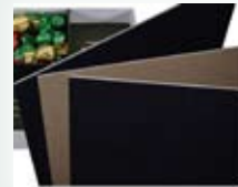
Black One-Side Chipboard