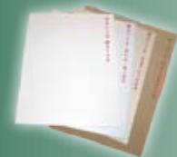
Solid White Laminated SBS Board