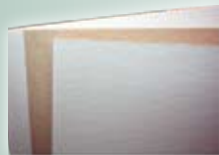
White VAT Lined Chipboard